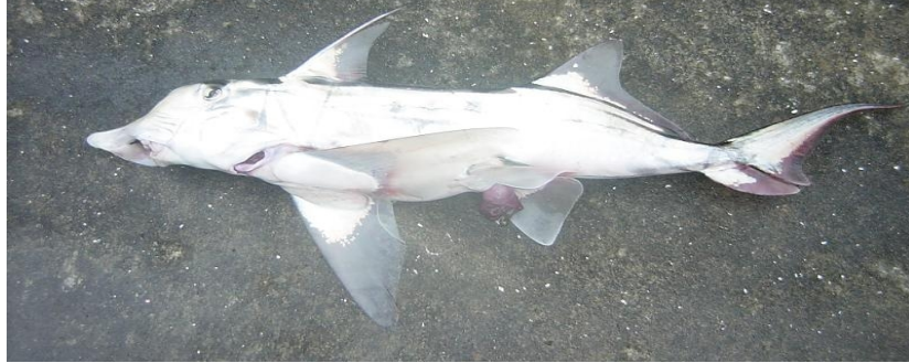
One of the best fish to consistently catch in the harbour – the elephantfish

Time of year - plenty of redcod and kahawai in the winter months, gurnard in the spring and through summer. snapper oct - may.